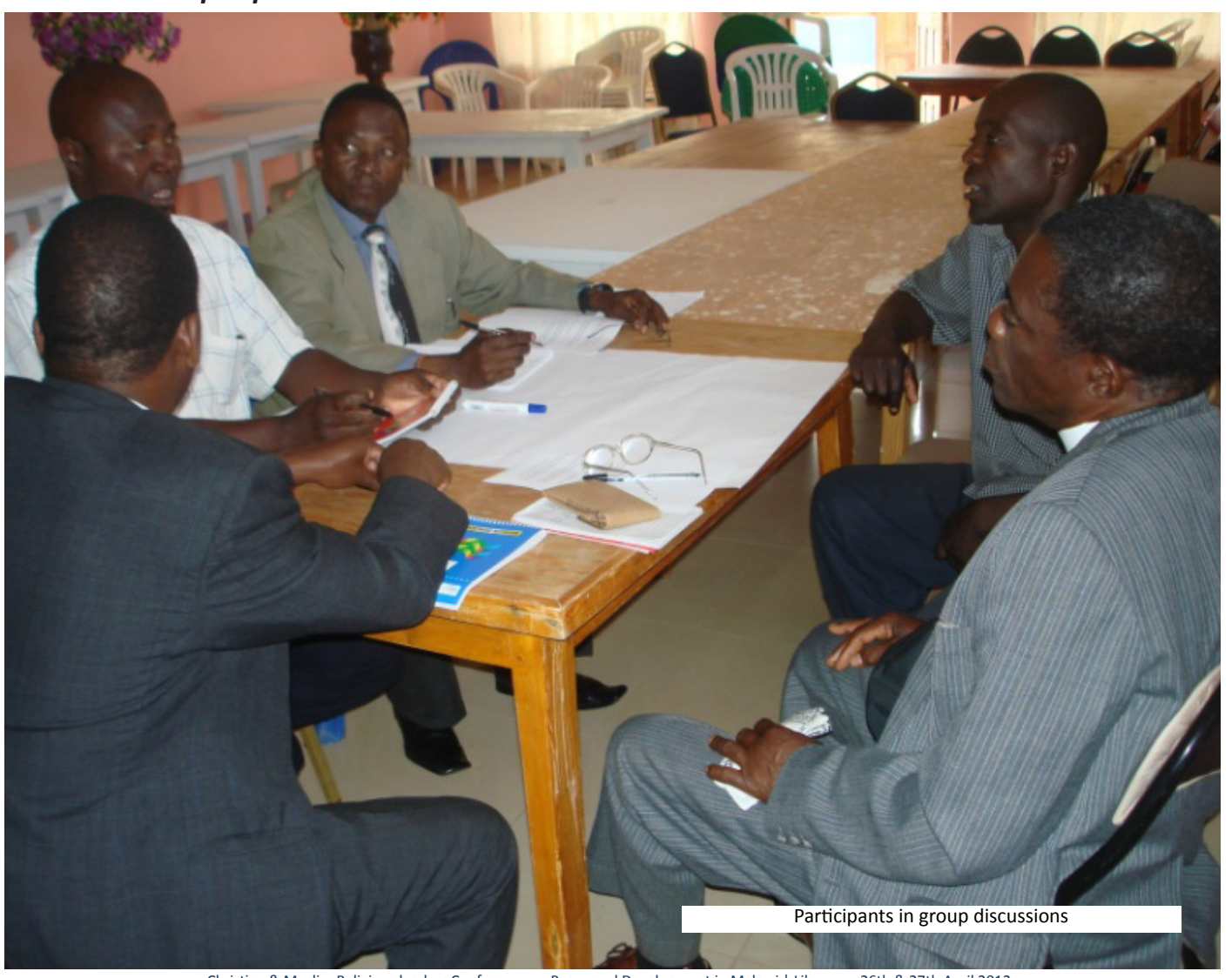
Christian & Muslim Religious leaders Conference on Peace and Development in Malawi | Lilongwe, 26th & 27th April 2012