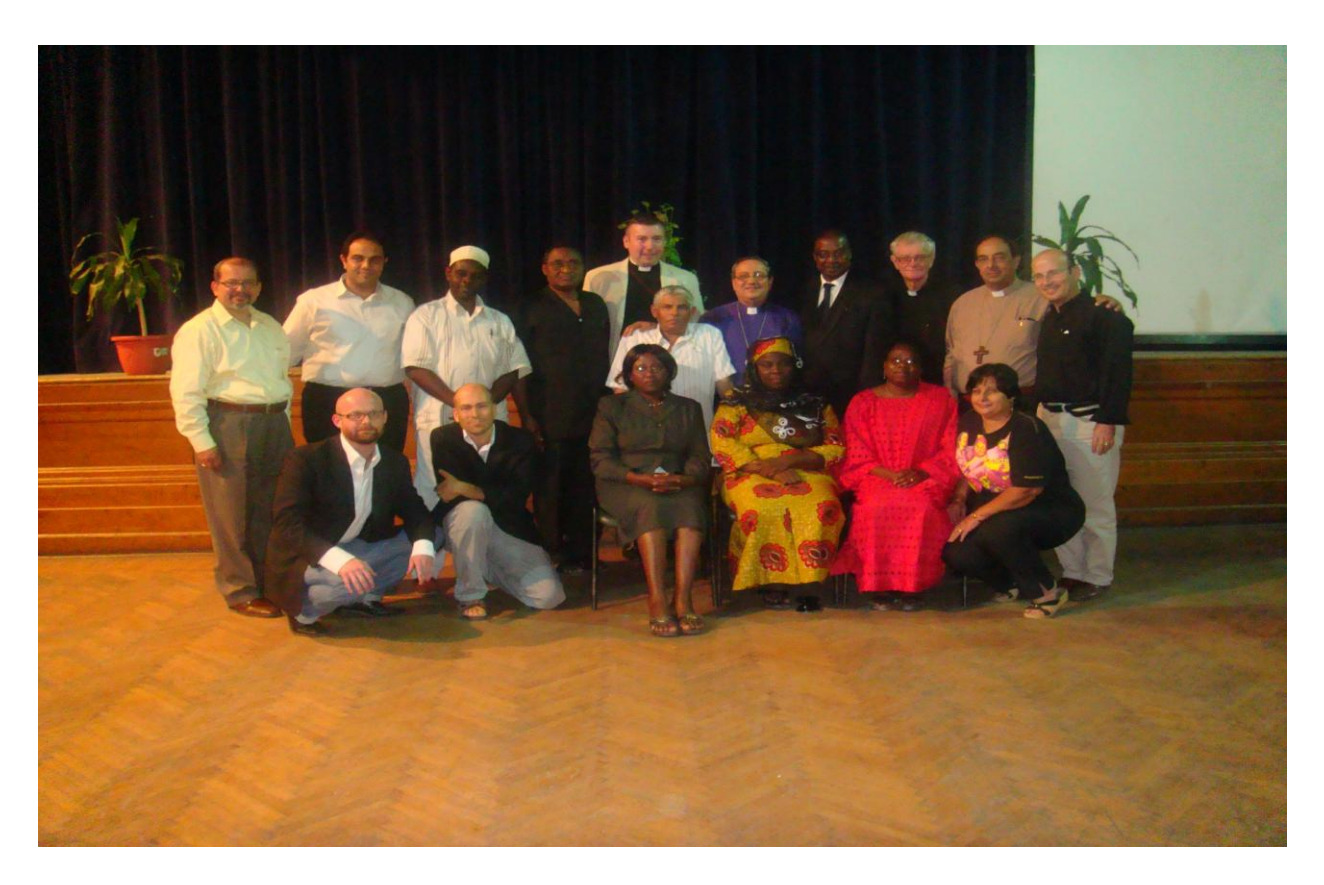
The Conference Participants