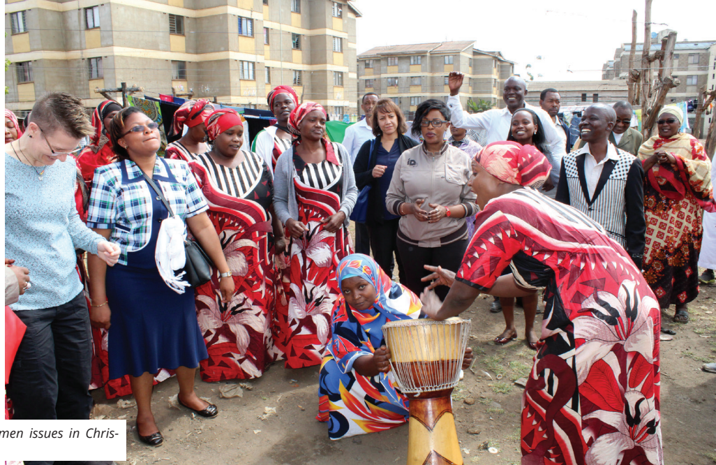
Capacity Building on women issues in Christian-Muslim relations