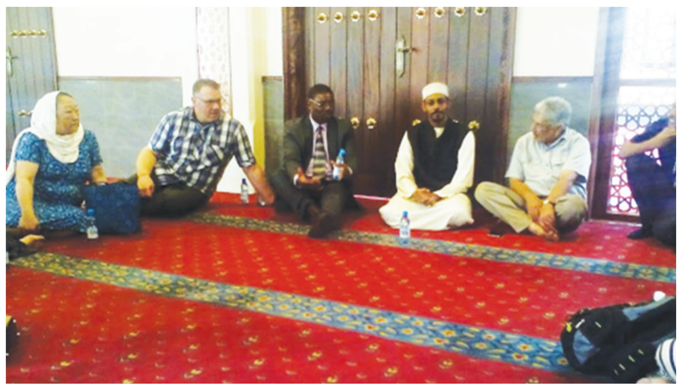
U.C.C. and PROCMURA team at Khoja Mosque in Nairobi Kenya

We would like to urge all our partners to feel free to organise pilgrims to visit us to share experiences and learn from each other, things such as culture religion and social and economic ethics.